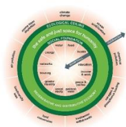
Donut Jury, Kate Raworth